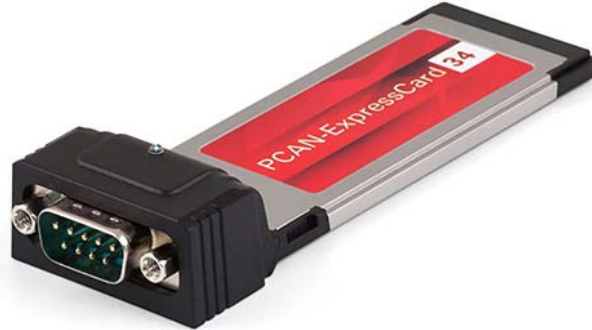
9-pole 커넥터 (male 핀 할당):

PCAN-ExpressCard-34 는 익스프레스 카드 슬롯이 있는 임베디드 PC 와 휴대용컴퓨터에 CAN 버스를 연결시킬 수 있습니다. 최대 300 볼트까지의 갈바닉 절연으로 PC 를 CAN 버스와 decouple 합니다.